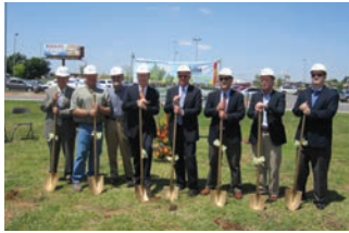
The Outlet Shoppes at Oklahoma City 7624 W. Reno Ave., Suite 380 Oklahoma City, OK 73127

To view more photos, see the schedule of upcoming Grand Openings or subscribe to the Grand Openings calendar, visit www.okcchamber.com/grandopenings .