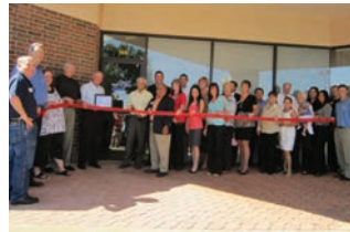
The Bank of Union Home Loans 3705 W. Memorial Road, Suite 1410 Oklahoma City, OK 73134