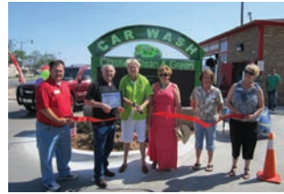
Classen Clean & Green Car Wash 2801 N. Classen Blvd. Oklahoma City, OK 73106