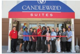
Candlewood Suites Hotel 4400 River Park Drive Oklahoma City, OK 73108