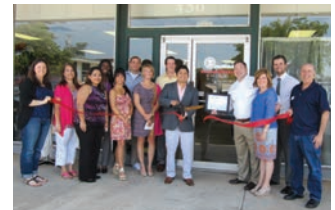
R&S Optimal Rehab 430 NW 10th St. Oklahoma City, OK 73103