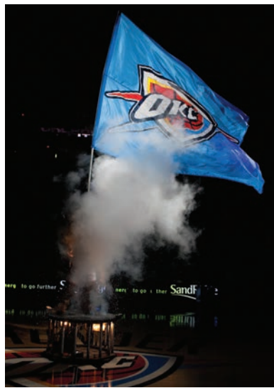
On June 12 and 14, Oklahoma City played host to the first two games of the 2012 NBA Finals.

Even before the Oklahoma City Thunder secured the title of Western Conference Champions over the San Antonio Spurs, the Chamber and many of its partners geared up for what would turn out to be the city's shining moment.