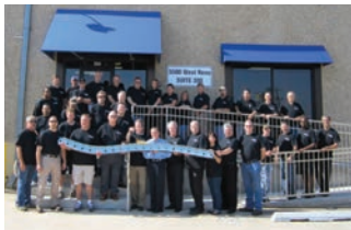
Progressive Stamping, LLC 5500 W. Reno, Suite 300 Oklahoma City, OK 73127