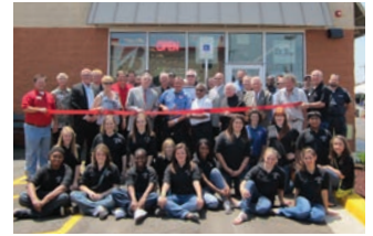
Firestone Complete Auto Care 13400 N. MacArthur Blvd. Oklahoma City, OK 73142