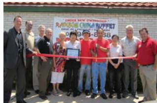
Rainbow China Buffet 500 S. Meridian Ave. Oklahoma City, OK 73108