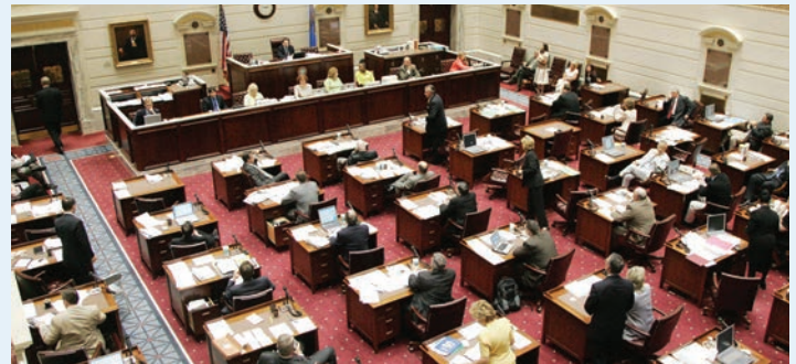
The 2012 Legislative Session came to a close at the end of May with many of the Chamber's priority issues seeing positive progress.

The Session began with Gov. Mary Fallin outlining a bold plan to significantly reduce and ultimately eliminate the state income tax. Believing elimination of the state personal income tax would result in shifting that tax burden to Oklahoma businesses or imperil funding for essential government programs, the Chamber and Tulsa Metro Chamber adopted a joint position which promoted responsible tax reform. At the end of the