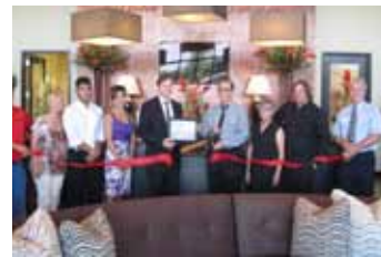
Winter House Interiors Classen Curve, 5710 N. Classen Blvd. Oklahoma City, OK 73118