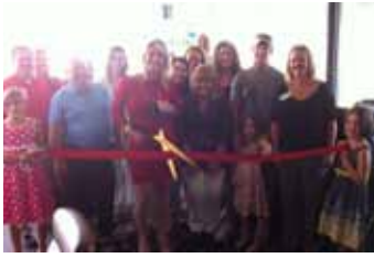
Encore Professional Medical Services/ GT Clean, Inc. 13431 N. Broadway, Suite 115 Oklahoma City, OK 73114

To view more photos, see the schedule of upcoming Grand Openings or subscribe to the Grand Openings calendar, visit www.okcchamber.com/grandopenings .