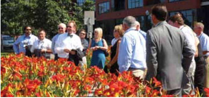
Oklahoma City delegates tour Gold Medal Park.

Oklahoma City leaders were in the Twin Cities – Minneapolis and St. Paul, Minn. July 25-26. During their visit, delegates learned about the education reform initiatives, how the Twin Cities are implementing significant transit programs and increasing quality of life for its citizens through the promotion of parks and recreational opportunities and more.