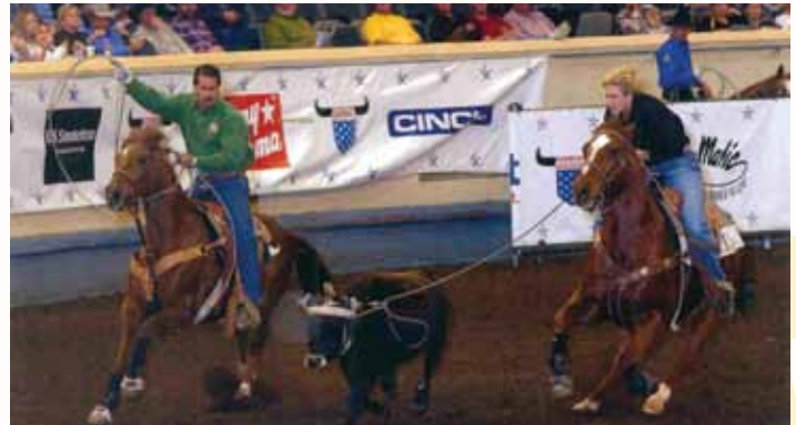
Fall is filled with equine activities at Oklahoma State Fair Park.

With prizes and awards reaching nearly $2.5 million, this show attracts more than 2,000 horses with participants from 49 states, seven Canadian provinces, United Kingdom, Italy, Germany, Brazil, Australia and Argentina.