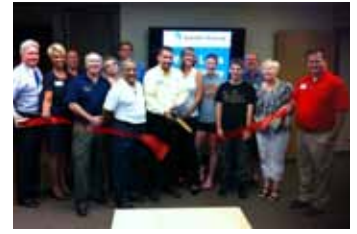
Sandler Training 3000 United Founders Blvd., Suite 224 Oklahoma City, OK 73112