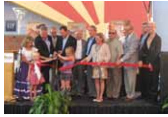
The Outlet Shoppes at Oklahoma City 7725 W. Reno Ave. Oklahoma City, OK 73127