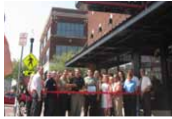
Hideaway Pizza 901 N. Broadway Ave. Oklahoma City, OK 73102