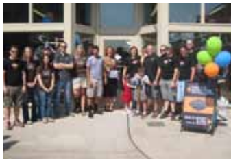
Schlegel Bicycles 905 N. Broadway Ave. Oklahoma City, OK 73102