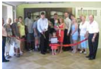
Trotter Overhead Door 15020 Bristol Park Blvd., Suite 300 Edmond, OK 73013