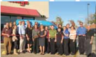
Market Fresh Catering by Arby's 4041 Northwest Expressway Oklahoma City, OK 73116