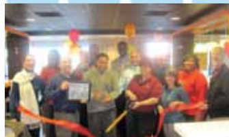
McDonald's 9001 S. Penn Oklahoma City, OK 73159