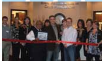
Oklahoma Center for Implants & Periodontics 9112 N. May Ave. Oklahoma City, OK 73112