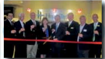
HoganTaylor LLP 11600 Broadway Extension, Suite 300 Oklahoma City, OK 73114