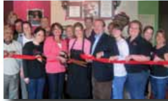
Gigi's Cupcakes 14101 N. May Ave., Suite 104 Oklahoma City, OK 73134