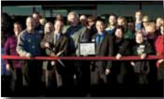
Comtech Design Print and Mail, LLC 117 E. Hill St. Oklahoma City, OK 73105

To view more photos and see the schedule of upcoming Grand Openings, visit www.okcchamber.com/grandopenings .